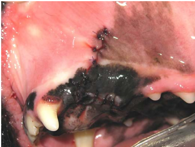
The flap was closed without any tension using an absorbable, monofilament suture material.