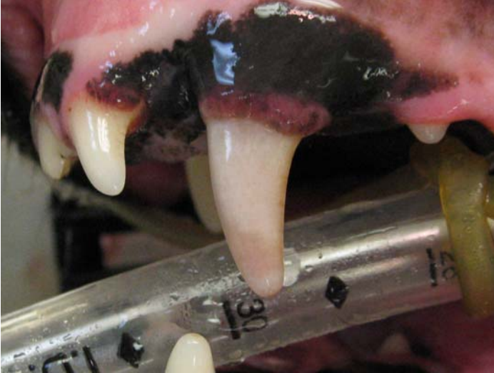
The photo shows the devitalized maxillary canine tooth that will be extracted.