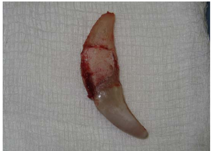
Photo of the extracted tooth.