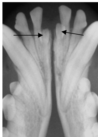
Intraoral radiographs show the missing incisors.