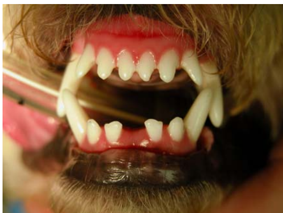
Photo showing the missing 1st mandibular incisors.

A two year old Bichon Frise presented for a routine periodontal evaluation and treatment. Aside from the minimal calculus and gingivitis discovered, the left and right mandibular permanent 1st incisors were missing.