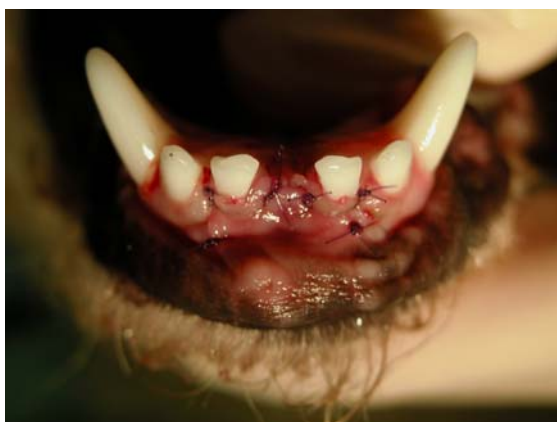
The flap used to access the impacted teeth was sutured closed.