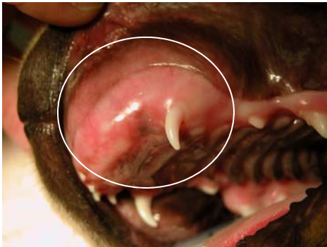
The circle area was swollen. Notice the missing incisors.

A 9 week old Labrador Retriever presented for a painful swelling on the left side of his muzzle. The swelling was noticed two weeks before presentation. Some of the dog's deciduous teeth were missing and the left maxillary canine tooth erupted much later than the right.